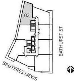
LEVEL LPH - PH