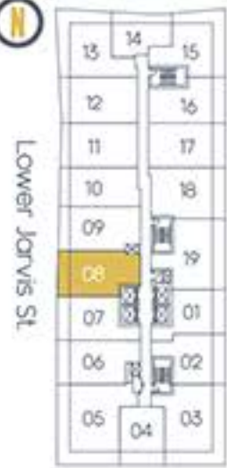
Queens Quay E. Floors 4-9