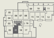
3RD FLOOR 9'-10" CEILINGS UNITS 1-3 & 6-20. 8'-10" CEILINGS UNITS 4 & 5.