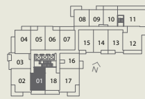
5TH FLOOR 9'-0" CEILINGS.