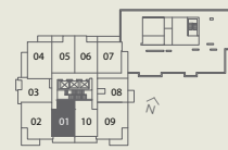
8TH FLOOR 9'-0" CEILINGS.