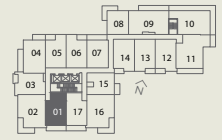
4TH, 6TH, 7TH FLOORS 9'-0" CEILINGS.