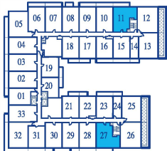
9TH FLOOR PLAN